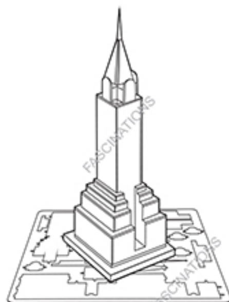
Chrysler Building Item No. MMS009