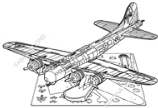
B-17 Flying Fortress Item No. MMS091