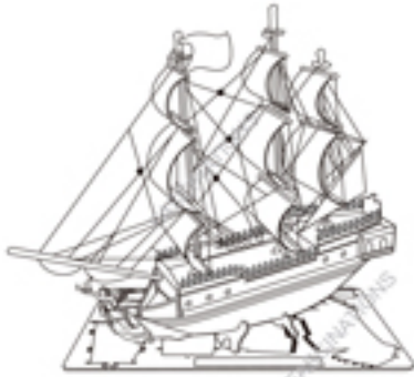
Black Pearl Item No. MMS012