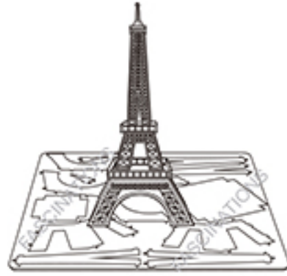
Eiffel Tower Item No. MMS016