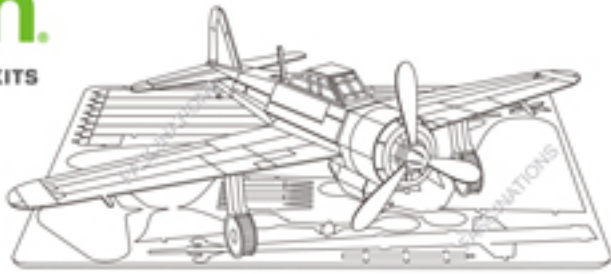
Zero Fighter Item No. MMS028