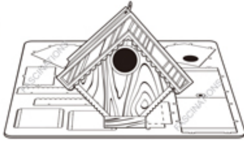
Birdhouse Item No. MMS039