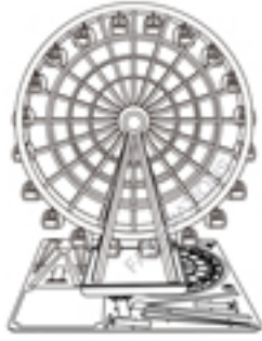
Ferris Wheel Item No. MMS044