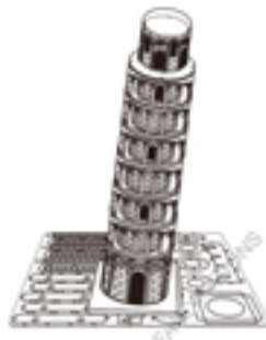
The Leaning Tower of Pisa Item No. MMS046