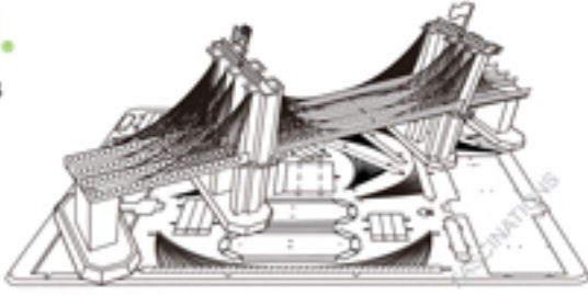
Brooklyn Bridge Item No. MMS048