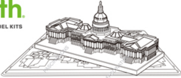
US Capitol Item No. MMS054