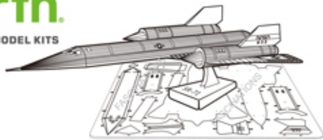
SR-71 Blackbird Item No. MMS062