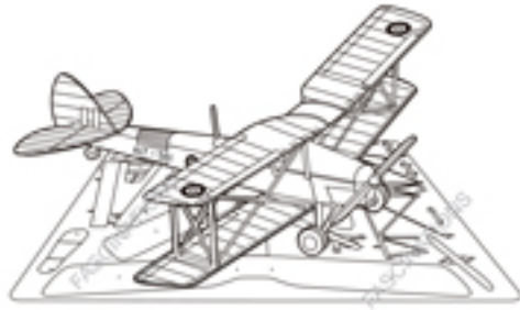
De Havilland Tiger Moth Item No. MMS066