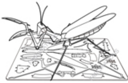
Praying Mantis Item No. MMS 069