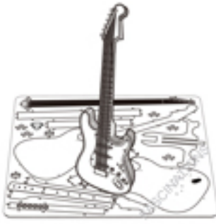
Electric Lead Guitar Item No. MMS074