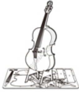
Bass Fiddle Item No. MMS081